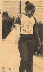
CAMPFIRE GIRLS, like the cutie above, picked up 38 bags of trash around Ike's Baseline sign recently.