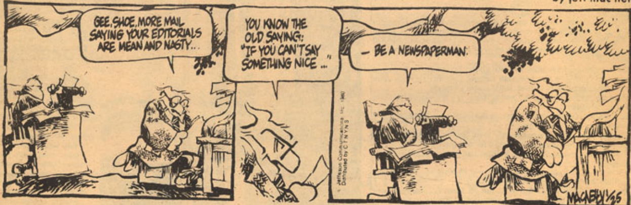
Editor's note: The above cartoon was reprinted from The Sun, San Bernardino, Ca.